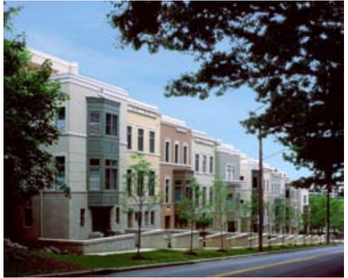
Honor Award for Urban Design Villa Carabelli at the Alta House Architect - City Architecture