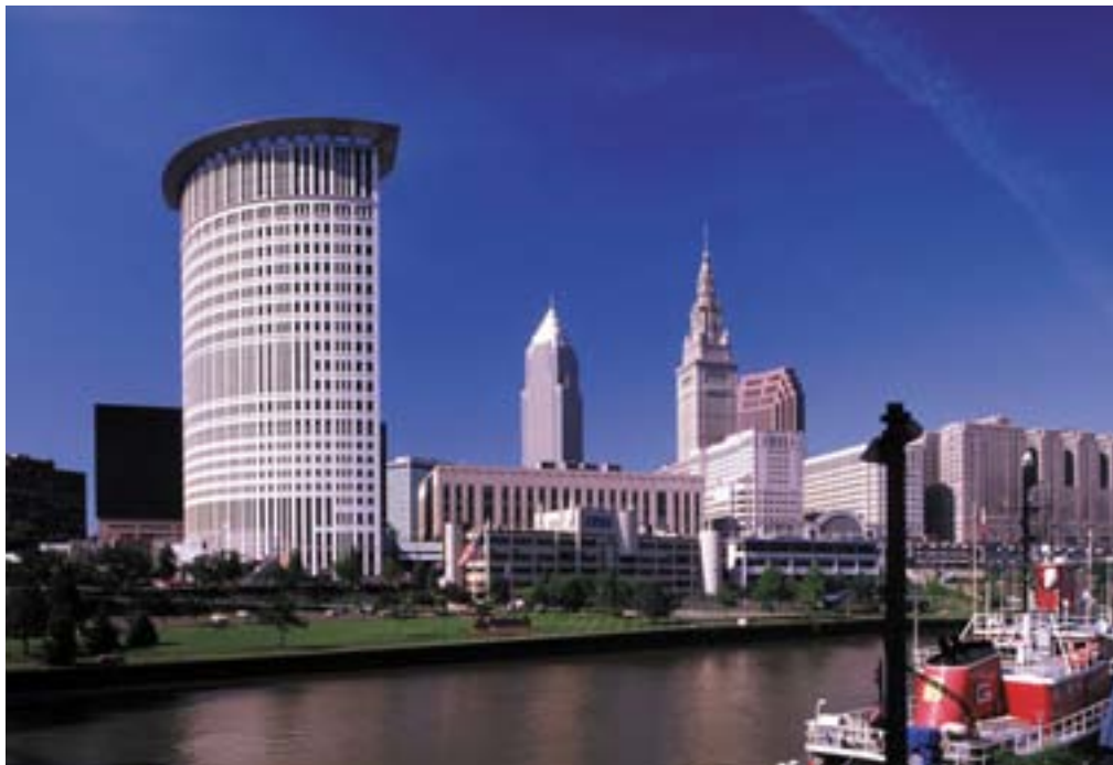
View of the Carl B. Stokes U.S. Courthouse from the Cuyahoga River.

The Institute invites all members who design or construct facilities for detention, rehabilitation, and justice to join the Academy and share in the goals of their mission statement sited above.