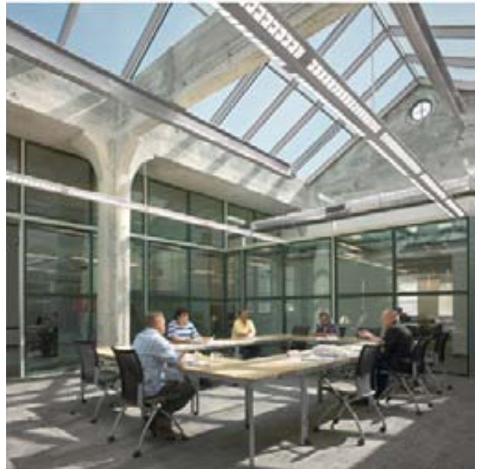
Honor Award for Renovation URS Cleveland Office Architect - URS Corporation